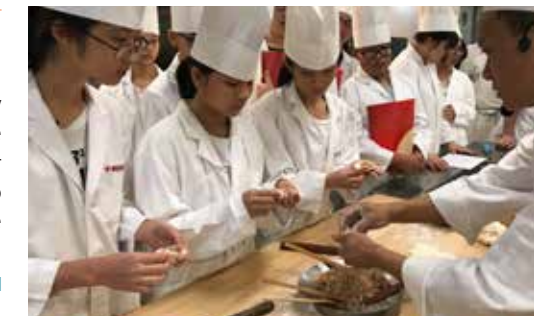
Project participants, who looked like professional chefs in their chef hats, making dim sum.

A group of project participants who wished to become cooks and join the catering industry visited the Chinese Culinary Institute. They put on chef hats and made Peking/Shanghai-style dim sum under the guidance of the instructors in a professional kitchen of the institute. After enjoying the end products together, they were given a guided tour of the institute's facilities to get to know more about the Chinese cook training programmes offered there and the information on entering the trade.