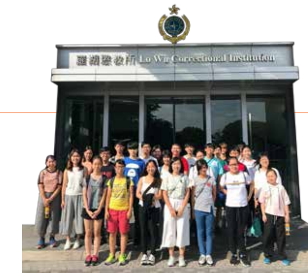
Project participants visiting correctional institutions to learn the importance of law-abiding and supporting offender rehabilitation.

Project participants visited the Tai Lam Correctional Institution and the Lo Wu Correctional Institution to meet with inmates and understand more about their unique life experiences through interaction and exchange of ideas. Participants also toured the main facilities of the institutions, including the inmates' dormitory, canteen and workplace, and were briefed on the work of the institutional staff and their entry requirements.