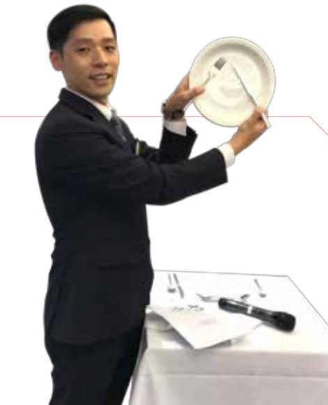
Project participants learning dining etiquette to help them feel at ease in social dining situations.

In addition to taking the opportunity to learn the western dining etiquette and table manners, project participants spent a pleasant afternoon enjoying a tea buffet at a hotel.