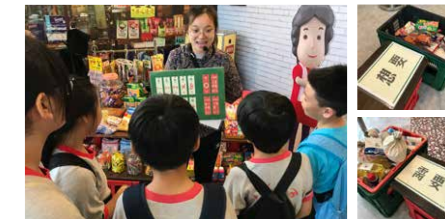
Project participants learning financial management from the role-play game in an easy and relaxed manner.

Through playing the roles as “wage earners” at a nostalgic small shop in Hong Kong, project participants learned the basic concept of financial management such as identifying and counting money, preparing estimates of income and expenditure, and distinguishing between “wants” and “needs”.