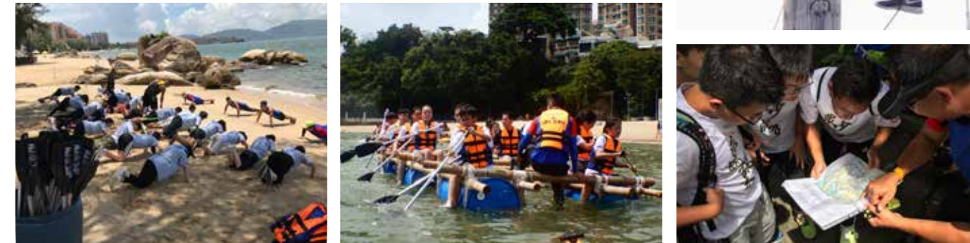
Braving the challenges in mountains and at sea, project participants earned self-assurance with the effort they made.

Project participants successfully completed a five-day-four-night leadership training programme at the JPC@Pat Heung. During the training period, they met the challenge of the longest (100 metres) zipline in Hong Kong, took part in night orienteering, learned the survival skills in the wild, built a raft and experienced canoeing. Other than enhancing their physical fitness, courage, problem-solving capability, team spirit and leadership, participants could also have a better understanding of the work of the Police Force through the programme.