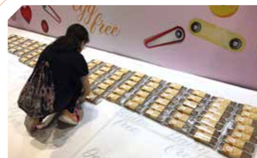
Project participants arranging “The Love Train” made of gluten-free bread to convey the message of freefrom foods.

Project participants set a Guinness World Record by working together to produce the world's largest gluten-free bread at the 1st Freefrom Festival Hong Kong. All the gluten-free bread for the event was made by Angelchild, a social enterprise which helps autistic youngsters in finding jobs. After the festival, the bread, together with words of blessing written by project participants, was donated to charities for distribution to needy families so that the latter could feel the love and care.